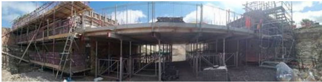
Panoramic view of Sandhill Road bridge works