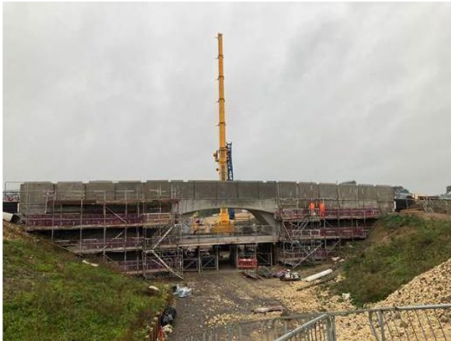
Elevation view of the Sandhill Road works [taken 19 October]